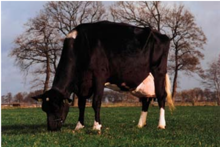
Peinzer 81 (champion All-Holland Dairy Show 1996)