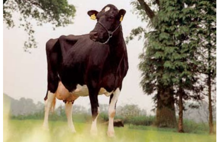
Helena 37 (more than 10,000 kg of fat and protein)