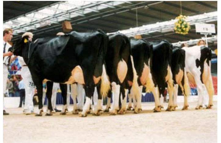
Daughtergroup F16 (All-Holland Dairy Show 1996)